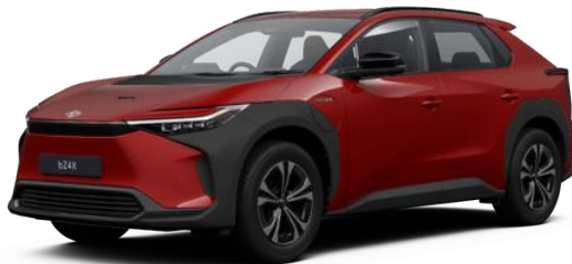
3U5 Pearl Red*