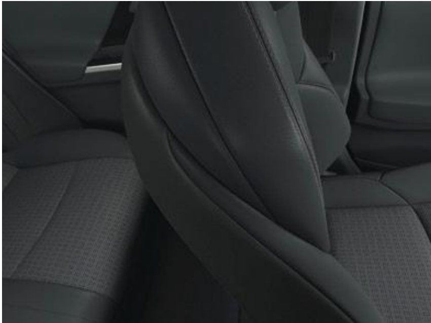
Black Partial Synthetic Leather and Fabric (R1HC)