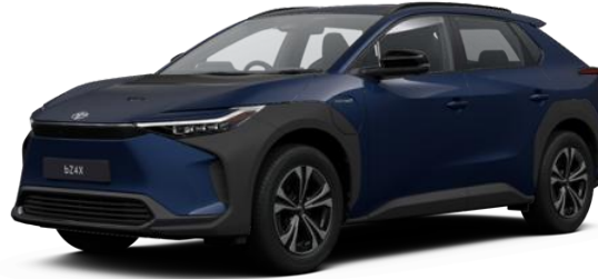
8S6 Pacific Blue*