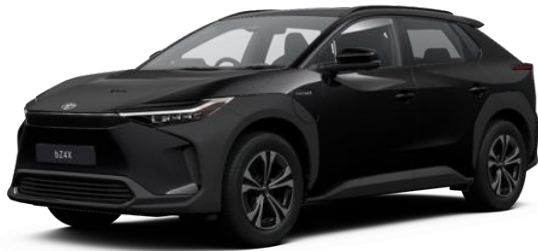
202 Astral Black-