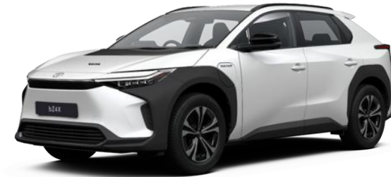
089 Pearl Ice White+