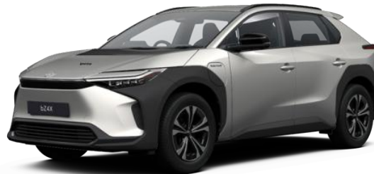
1J6 Precious Silver*