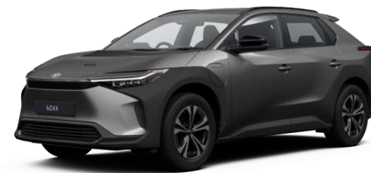
1L5 Precious Metal*